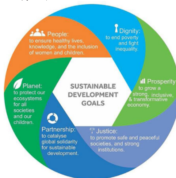
Figure 2. Essential Elements for Delivering the Sustainable Development Goals (Rahman et al., 2019, p. 5).

Accordingly, sustainable development aims to use new methods in economic and social aspects that help benefit from environmental resources currently without harming the ability of future generations to benefit from them as well. It is development that aims to increase the individual's ability to produce and aims to achieve justice and equality without discrimination or conflict between generations, through interest in developing human resources and empowering them in a way that makes the individual the means and the goal of development itself. Figure 2 shows a summary of the goals of sustainable development (Abu Al-Nasr, 2017, p. 87).